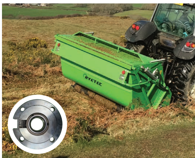
Cutting and clearing gorse

A combination of HD cast rotor mountings, 1.4kg hammer flails and HD machined bearing housings allow the machine to work in the most extreme conditions reducing the risk of damaging the machine from hitting unknown and unseen obstacles.