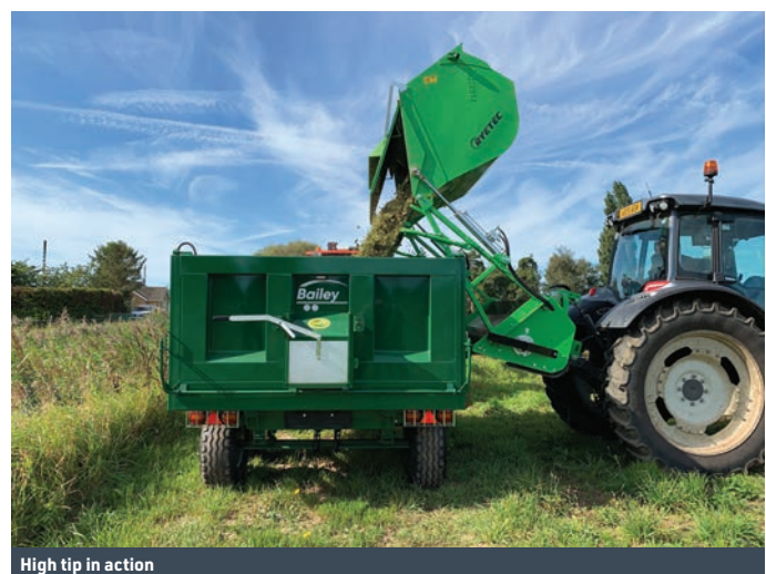
High tip in action