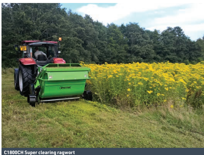
C1800CH Super clearing ragwort