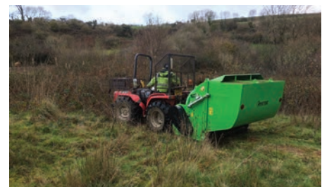
C1600C clearing scrub